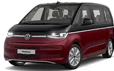
Deep Black / Fortana Red*