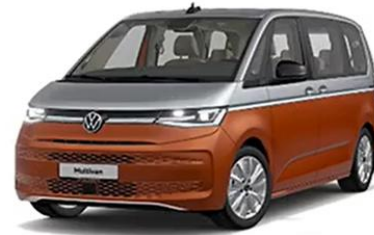
Mono Silver / Energetic Orange*