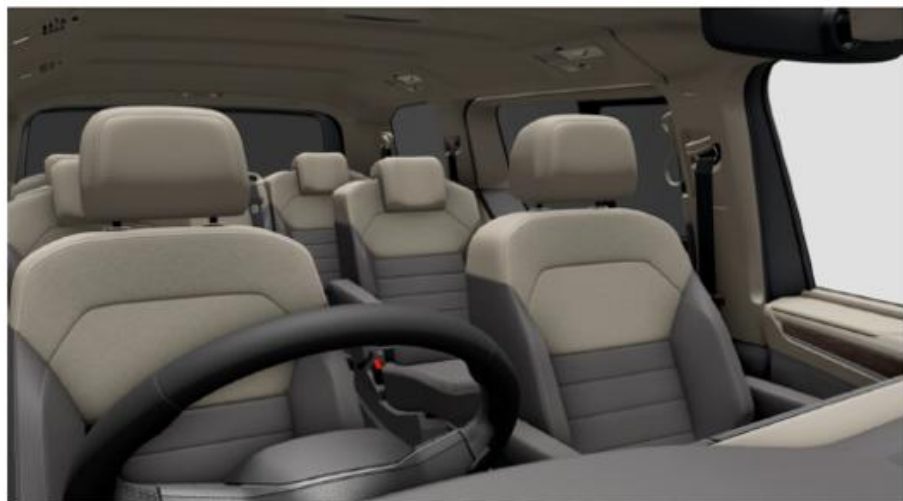
Seat trims 'ArtVelours' in bi-colour microfleece (standard on Style)