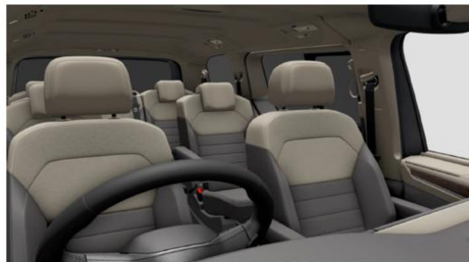
Seat trims 'Savona' in bi-colour leather (optional on Life) (optional on Style)