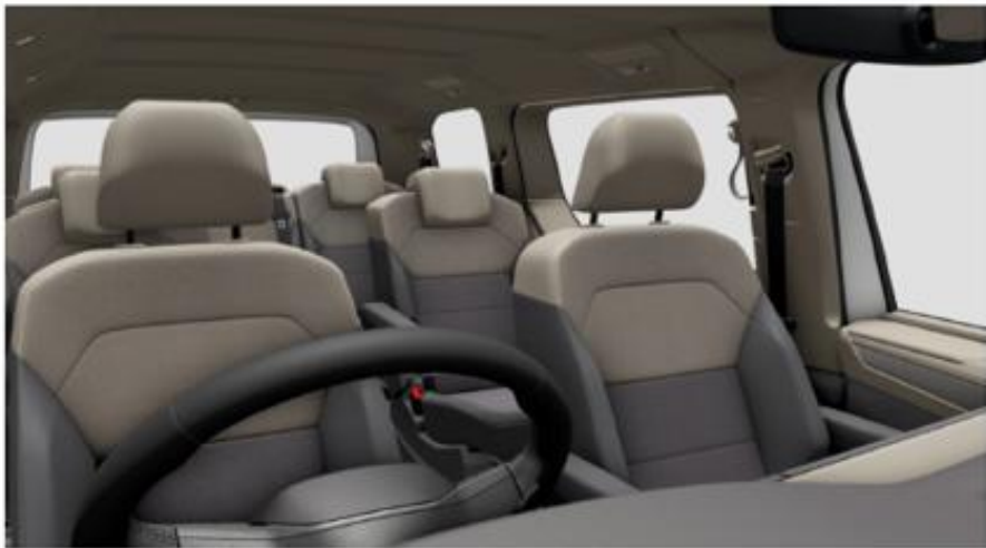
Seat trims "Ribella" in bi-colour fabric (standard on Life)